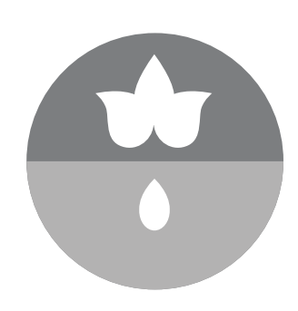
We shape the future today.